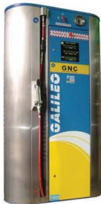
Dispenser Line with state of the art technology