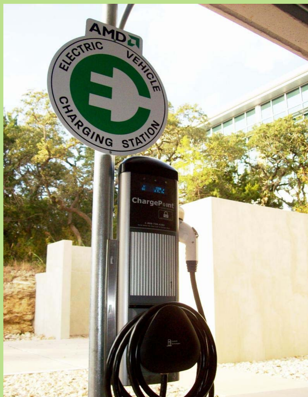
AMD Lonstar Campus Austin, Tx

→ AMD LoneStar Campus in Austin choose ChargePoint